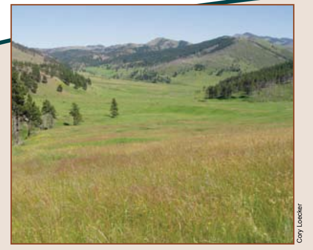
Rest-Rotation Grazing System To take pressure off adjacent private lands where elk frequently concentrate, FWP staff worked with Sieben Livestock to design and test a rest-rotation grazing system across borders. They gave some private lands rest from grazing and rejuvenated lands in need of grazing on the WMA.