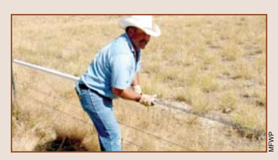
Wildlife-Friendly Fence Landowners are saving time and money from frustrating repairs caused by elk, deer and other animals breaking through fences. More wildlife are surviving by safely negotiating wildlife-friendly fences. Many fence improvements are low-cost and designed or adapted by landowners.

Montana is one big community of people and wildlife all sharing its magnificent mountains, plains, forests and rivers. The Landowner/Wildlife Resources Program lends a helping hand across private and public land boundaries. We also share and promote wildlife-friendly solutions through community tours and demonstration areas.