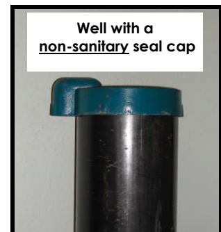
Well with a non-sanitary seal cap

Water is the universal solvent. During spring runoff and storm events, surface water can encounter many different kinds of pollutants such as lawn pesticides and animal feces and easily transport them to your well. Because these and many other contaminants are not easily detected by taste or smell, laboratory testing is the best method of determining if any unsafe levels are present. Tests for coliform bacteria and nitrates should be taken annually regardless of whether your well cap is properly sealed because well water can become contaminated from many different sources.